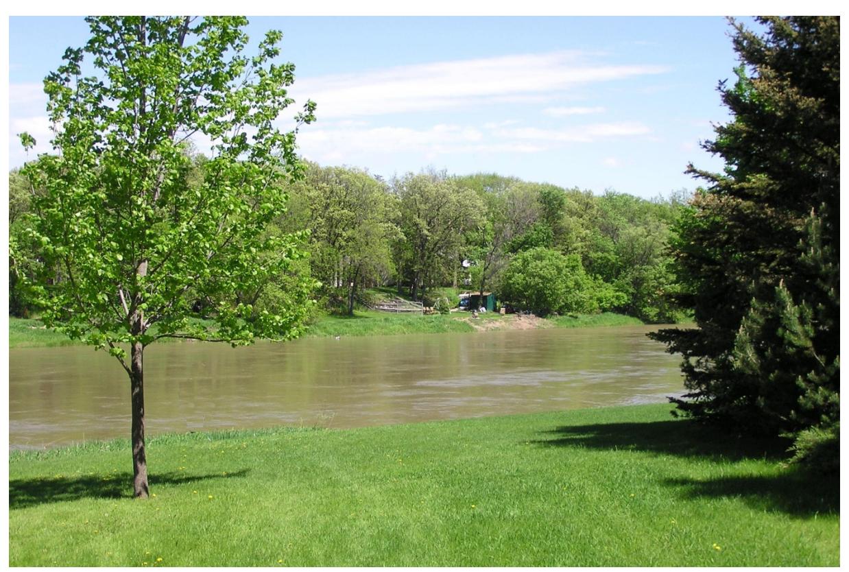
Site of the ferry located at the Passage